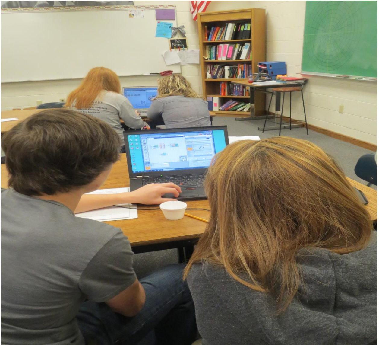
Figure 2-1. Students construct a program using the LEGO® educational software.

Interpersonal and communication skills were stressed as students were divided into four teams. They were given tutorials that presented scenario problem statements to work on throughout the sessions. Combined with PowerPoint presentations and demonstrations, students worked hands-on with pre-built LEGO® NXT Intelligent Vehicles and LEGO® education software (see Figure 2-1). Measurement criteria in the lesson plans consist of pre- and post-tests, lesson review worksheets, and mini assessments.