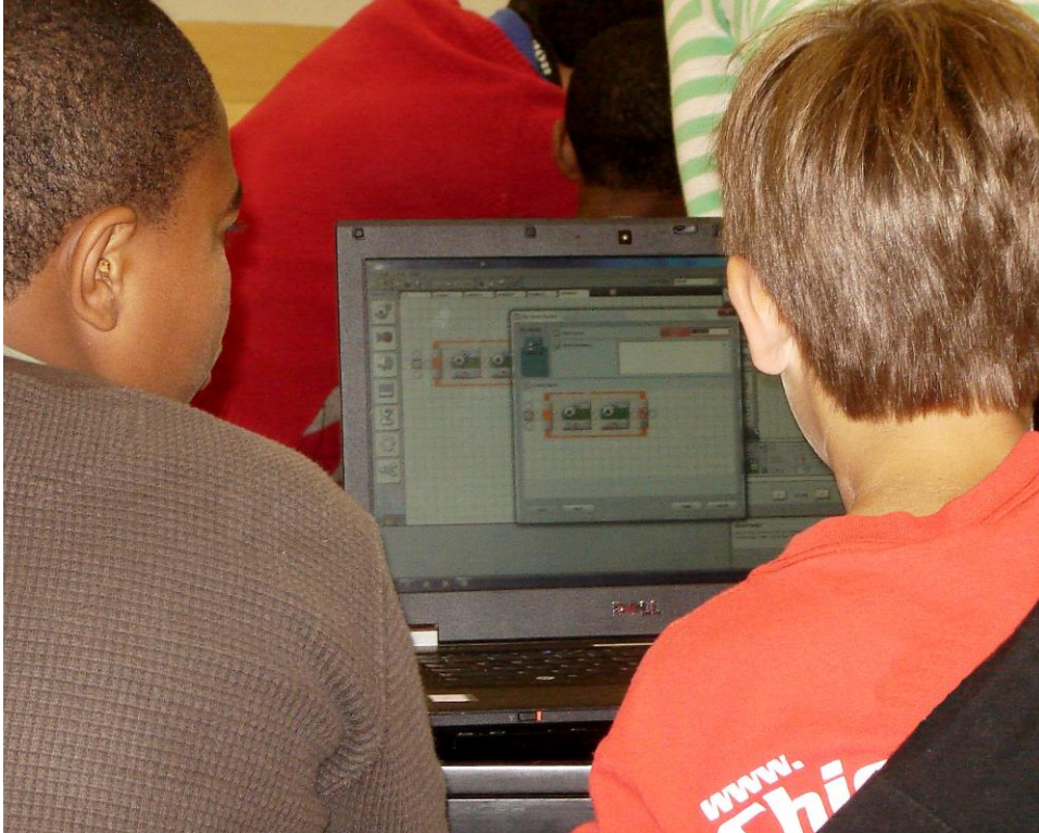
Figure 2-1. Students construct a program using the LEGO® educational software.

Interpersonal and communication skills were stressed as students were divided into four teams. They were given tutorials that presented scenario problem statements to work on throughout the sessions. Combined with PowerPoint presentations and demonstrations, students worked hands-on with pre-built LEGO® NXT Intelligent Vehicles and LEGO® education software (see Figure 2-1). Measurement criteria in the lesson plans consist of pre- and post-tests, lesson review worksheets, and mini assessments.